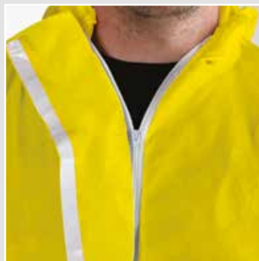
2-way front zip