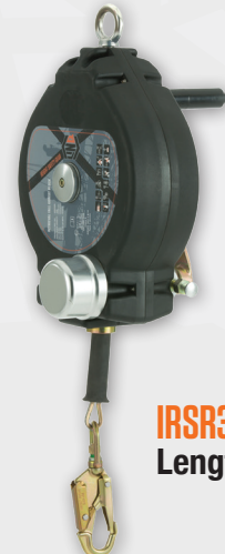
IRSR30R Length: 30m

SELF RETRACTING TYPE 3 LOQ-BLOQ with RETRIEVAL FUNCTION