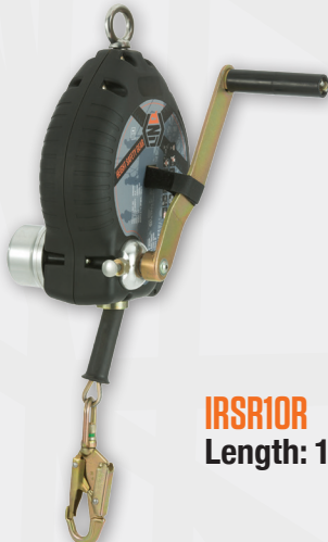
IRSR10R Length: 10m